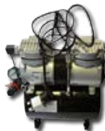
37cm x 13.5cm x 31.5cm

To help make it easier to inflate our bags we fit a small green nozzle to every bag (except small phone bag and toner bags) which means no fiddling or looking for an inflation hole.