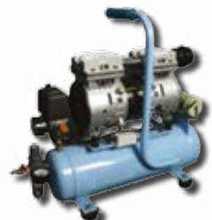
55cm x 20.5cm x 51cm