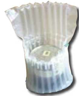
Bespoke paint tin bag 1, 2.5 and 5 litre bags available